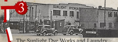
The Sunlight Dye Works and Laundry